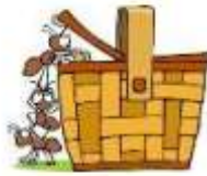
Table service provided

to their Annual Church Potluck/Picnic – Sunday, September 22 at 12:30 at the home of Dave Sharninghouse, 5421 Twp. Rd. 136, Findlay.